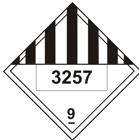
Figure 1: Example of Class 9 DOT placard

Note: The preceding information is subject to frequent change. Consult DOT and OSHA regulations for current requirements.